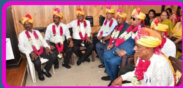
Delhi Police wishes you Happy Retirement